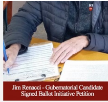
Jim Renacci - Gubernatorial Candidate Signed Ballot Initiative Petition